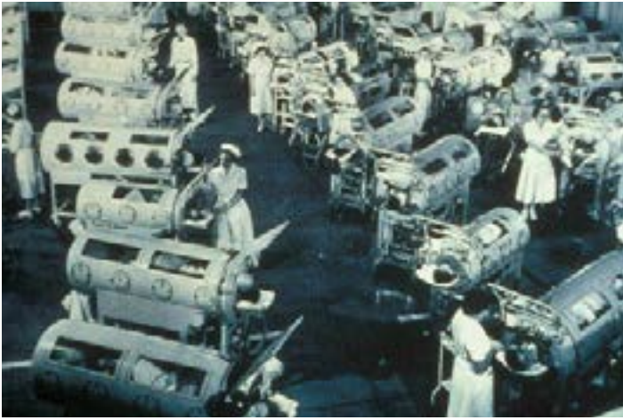
Polio patients in the iron lung ward at Rancho Los Amigos Hospital in Los Angeles, 3 years before the Salk vaccine came out. Many polio survivors remained in the “iron lung” machine for life.

(i.e., able to cause disease in human beings). Only a handful of these pathogens pose a serious threat to public health. However, most of these dangerous few exist only in human beings (the exceptions are Clostridium tetani [which causes tetanus] and the rabies virus). If a disease has no wild reservoir, you can wipe it off the face of the earth by vaccinating enough human beings all at once.