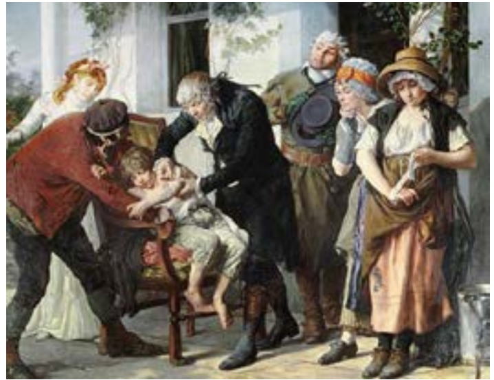
Edward Jenner administering the first smallpox vaccine in 1796. Painting by Gaston Mellingue (1879).

Polio was once called infantile paralysis. The polio-virus typically causes a mild gastrointestinal infection. But the virus can spread to the nervous